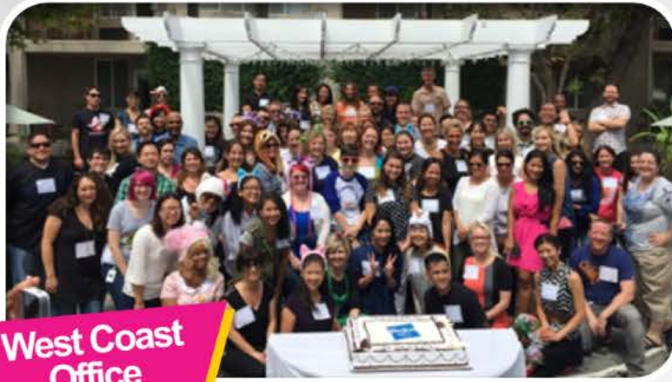
West Coast Office