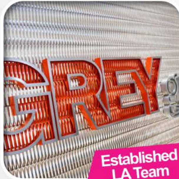
Established LA Team